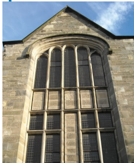
St Andrews Baptist Church Teaching Biblical Principles

The church enjoys vibrant worship in a family atmosphere and we invite all to join us in exploring what the Bible has to say to us today.